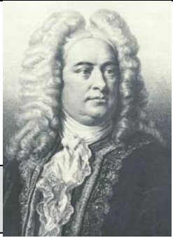
George Frederic Handel Germany, Baroque Period

Near the end of his life, Handel became blind but still continued to perform on the organ and still composed music by dictating it to a friend who wrote it down.