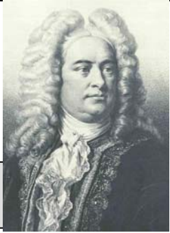
George Frederic Handel Germany, Baroque

Handel was the son of a barber-surgeon. His father had definite plans for his son. He wanted George to become a lawyer, but George was captured by the sound of music.