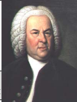
Johann Sebastian Bach Germany, Baroque Period

Since most of Bach's music was written to be performed in a church service only once, very little of his music was published during his lifetime. His musical genius was not recognized until 100 years after his death.