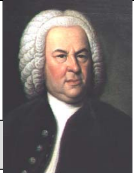
Johann Sebastian Bach Germany, Baroque Period

Bach's music was written to be performed only once in a church service then thrown out! It was for this reason that Bach composed more music than almost any other composer.